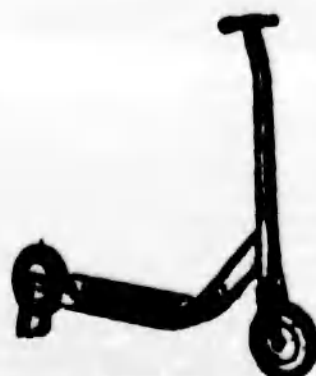
SCOOTERS and BICYCLES